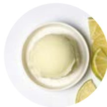
Lime with Caribbean limes