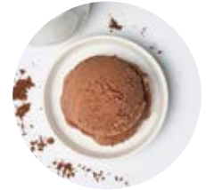
Milk Chocolate with fresh milk from our farm