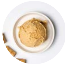
Toffee typical Argentine crema mou