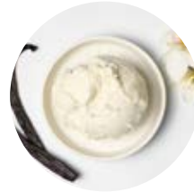
Vanilla from Madagascar with pieces of vanilla pod