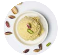
Pistachio 5.0 with the best pistachios of the season