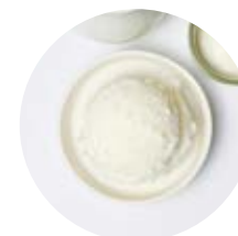
Yogurt natural with live ferments