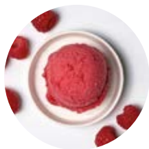
Raspberry with Italian raspberries