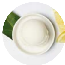
Lemon Sicilian lemon cold pressed juice