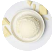
White Chocolate with 30% of white chocolate