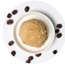
Coffee finest Brazilian blend coffee