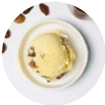
Malaga with sultanas and Marsala DOP wine