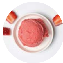
Strawberry with Charlotte and Camarosa strawberries