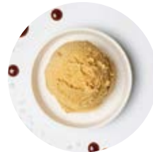
Salted Caramel with sea salt