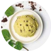
Mint Choc Chip mint and dark chocolate chips