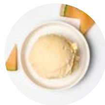
Melon with fresh Italian melon