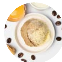
Tiramisù the Italian combination of zabaione, coffee and lady fingers