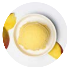
Mango with Indian mango