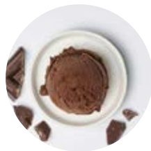
Dark Chocolate with 24% plain chocolate