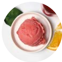
Red Orange with Sicilian red orange

Our sorbets, despite being free of milk and fats to better highlight the selected fruit they are made from, have a texture closer to that of ice cream thanks to our churning technique. They are delicious and refreshing, yet not too high in calories, containing only about 140 Kcal per 100g.