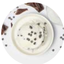
Stracciatella with plain chocolate chips