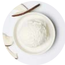
Coconut with genuine coconut pulp