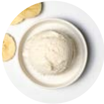
Banana selected Ecuadorian banana