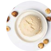
Hazelnut product obtained exclusively from "Piedmont hazelnut IGP"